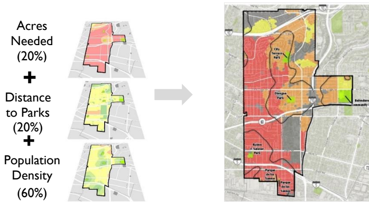
Subarea need varies within each Study Area

In fact, population density was one of three metrics used to determine park need in subareas: