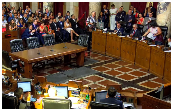
City Council Meeting

Resolutions may be passed by the city council, parks commission, or other elected or appointed body.